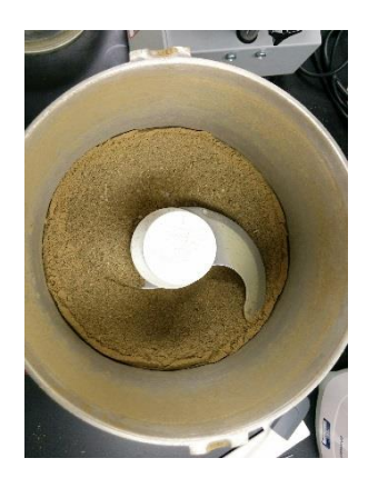
Figure 1. Cannabis sample before (left) and after (right) homogenization with dry ice.