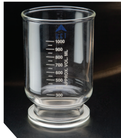
90mm 1000ml Funnel