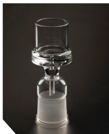
Glass Cartridge Adapter