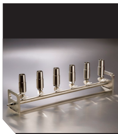
6 Station Manifold