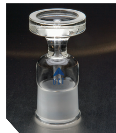
47mm Support Base