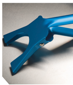
90mm Aluminum Clamp