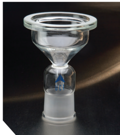
90mm Support Base