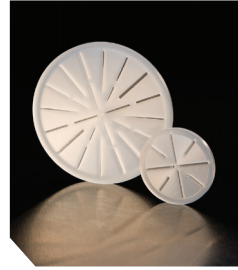
47mm/90mm KEL-F Screen