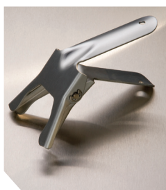
47mm Aluminum Clamp