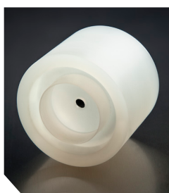
Universal Cartridge Adapter