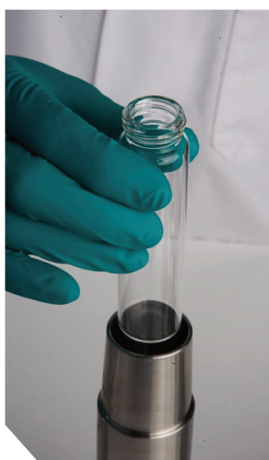
Insertion of a glass vial into the vacuum manifold