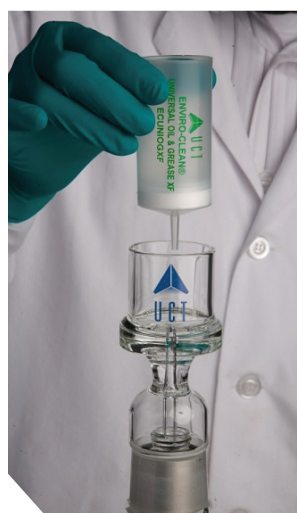
Drip tube inside top of vial

Once a collection vial has been inserted in the vacuum manifold, carefully place the glass cartridge adaptor on the manifold making sure the drip tip fits inside the vial. A variety of UCT universal solid-phase extraction cartridges may then be inserted into the cartridge adaptor.