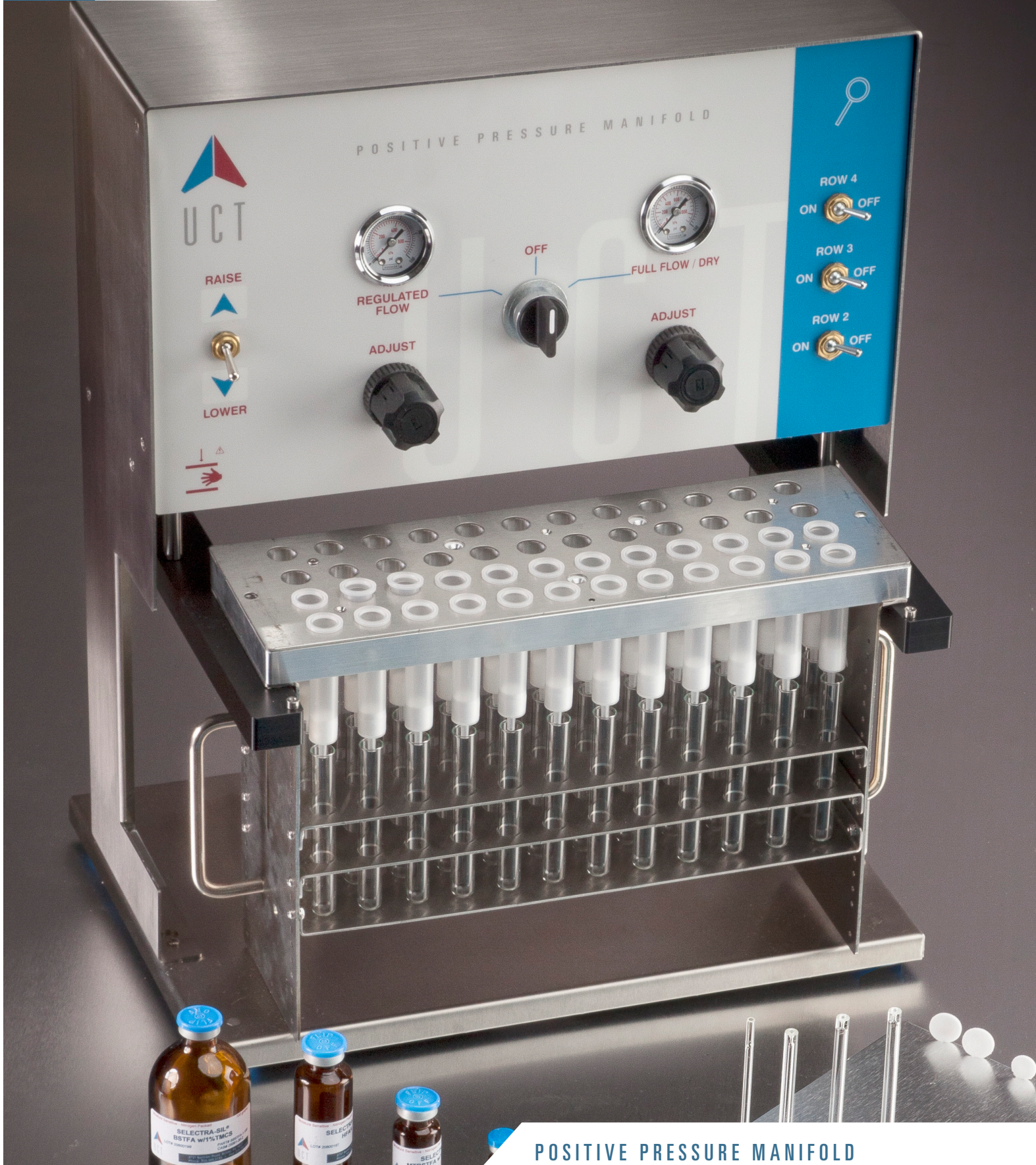
POSITIVE PRESSURE MANIFOLD